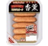
Products from the Koukun series