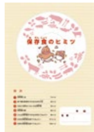
Brochure: The Secret of Preserved Foods

In fiscal 2020, the seventh year of the school engagement program, we provided learning materials to 118 schools, with a total of 9,116 elementary students. In previous years, we provided schools with samples of our products, such as Koukun Sausage, creating a direct connection between Prima Meat Packers and its young fans. We have suspended the program for the time being due to COVID-19, but we intend to continue it in the future.